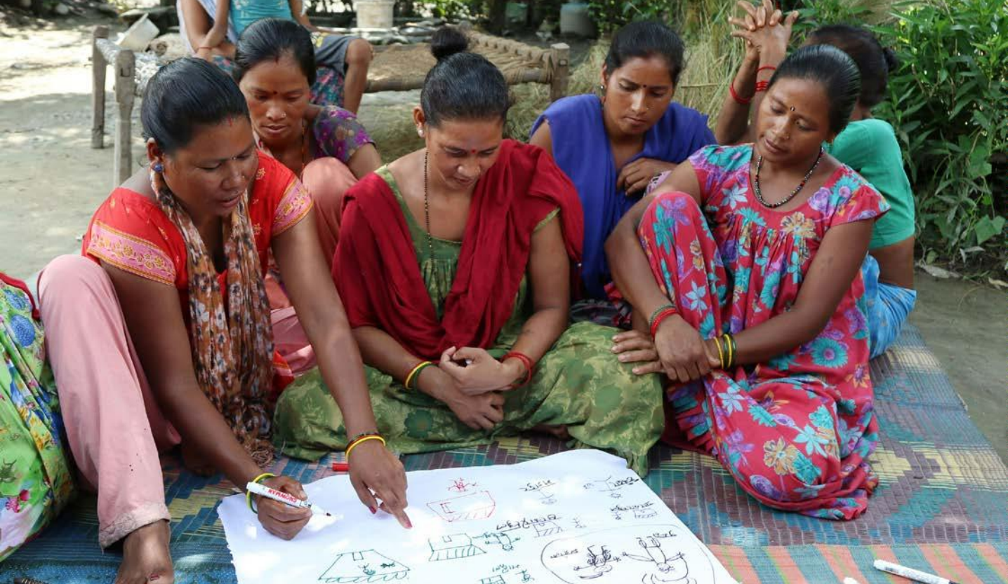
Reflection-Action circles are the basis for identifying community problems and their causes, empowering right-holders and finding solutions. These circles are the entry point for all the initiatives in the community.