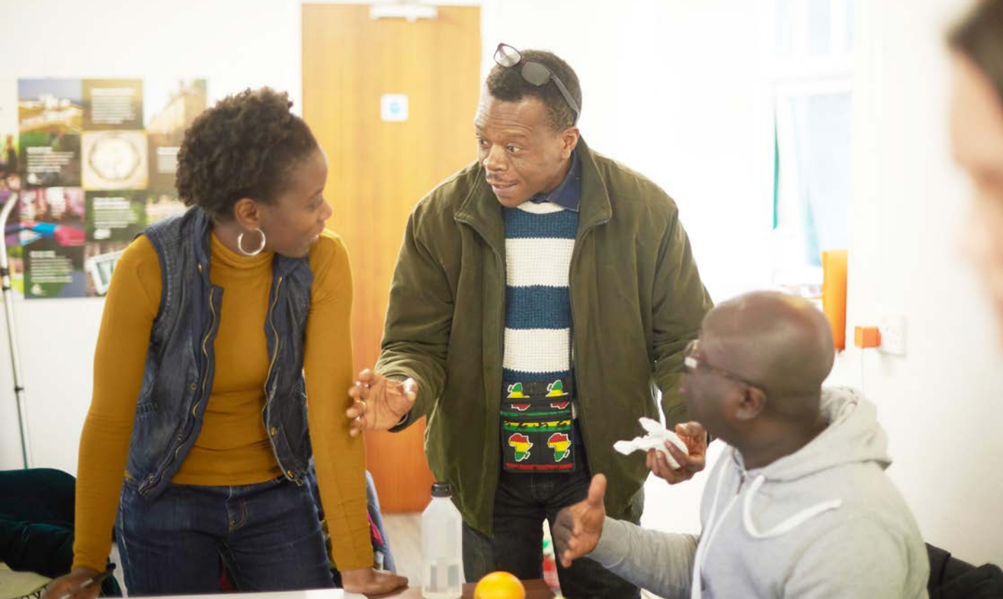
Community Campaigners discussing strategy.