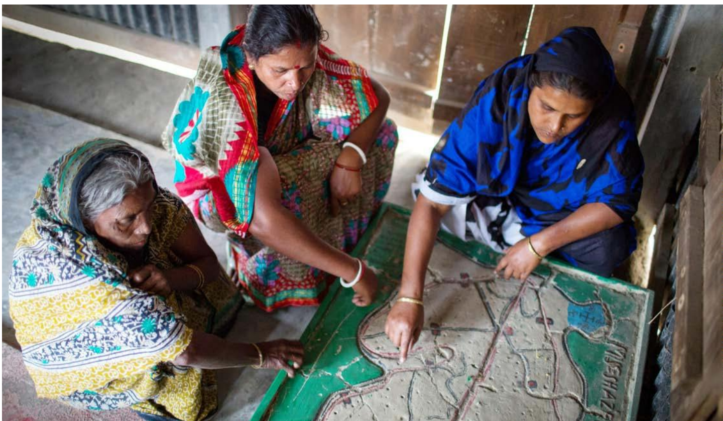
Women in Bangladesh analyse their risks of flooding and disaster, with a view to reducing risk.