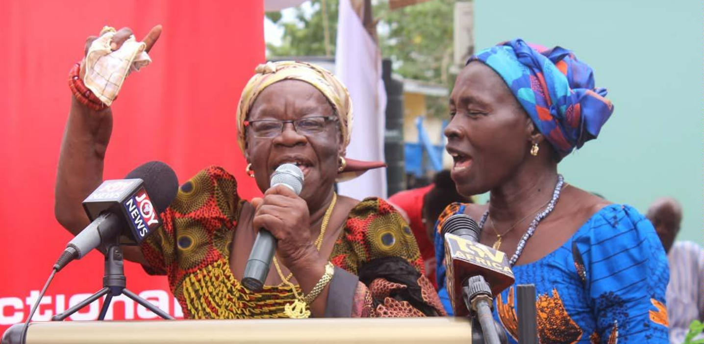
The launch of evidence around women's unpaid care work, climate resilience and agroecology as part of the Promoting Opportunities for Women's Empowerment and Rights (POWER) project in Adaklu Waya community in the Volta Region of Ghana.