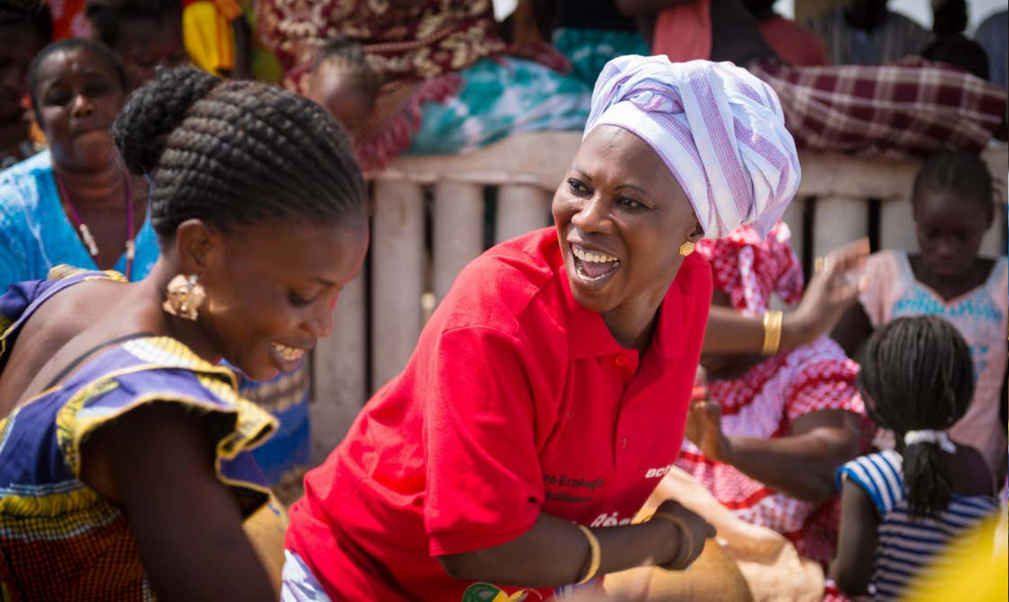
Bringing together agroecology and resilience project participants from the Gambia and Senegal.