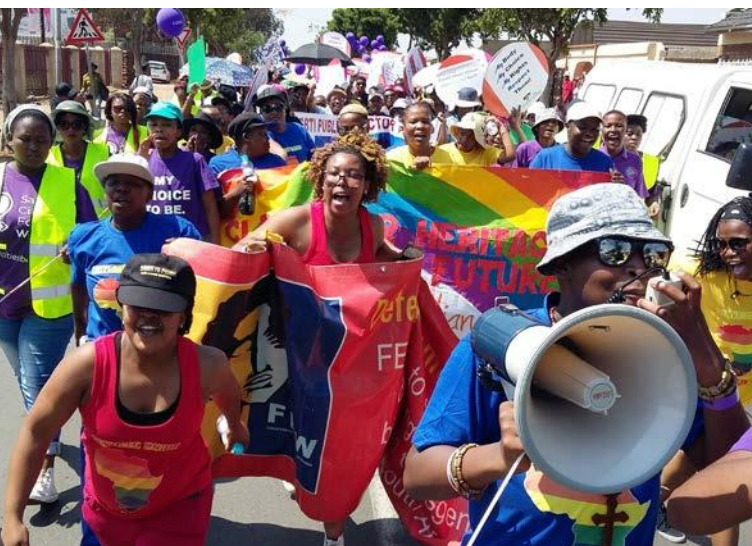
Activists march through the streets demanding equality and an end to homophobia and prejudice during the annual Soweto Pride, South Africa.