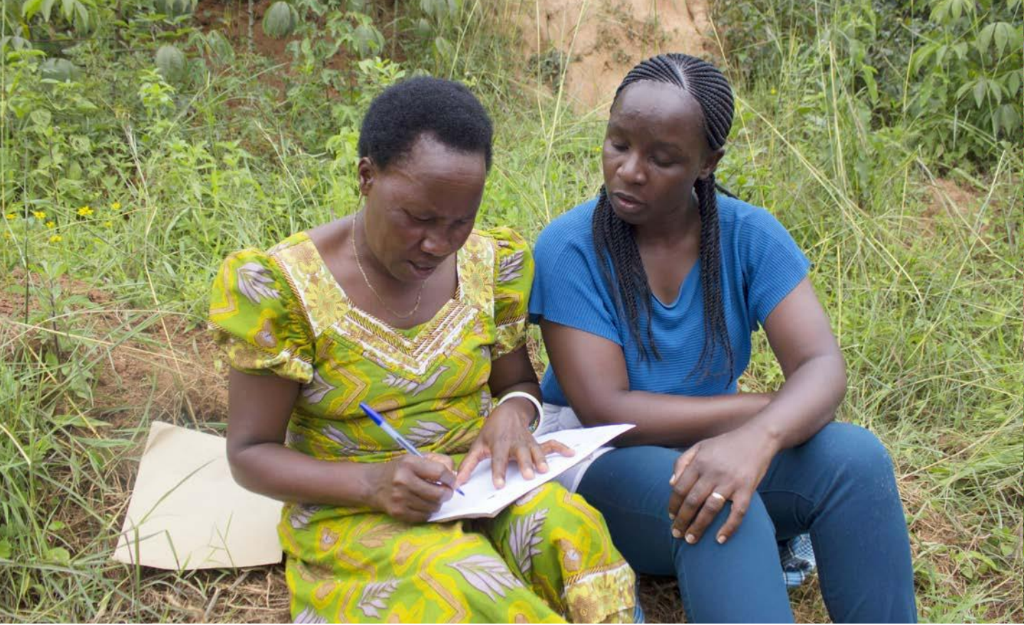
Interviews with Abishyize women's group, Rwanda.