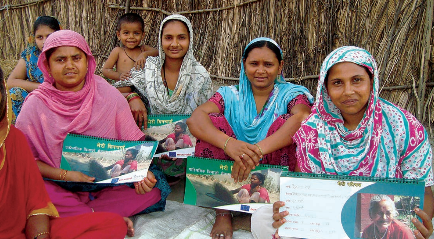
Women engaged in filling time diary collection in Banke, Nepal, hold calendars developed.