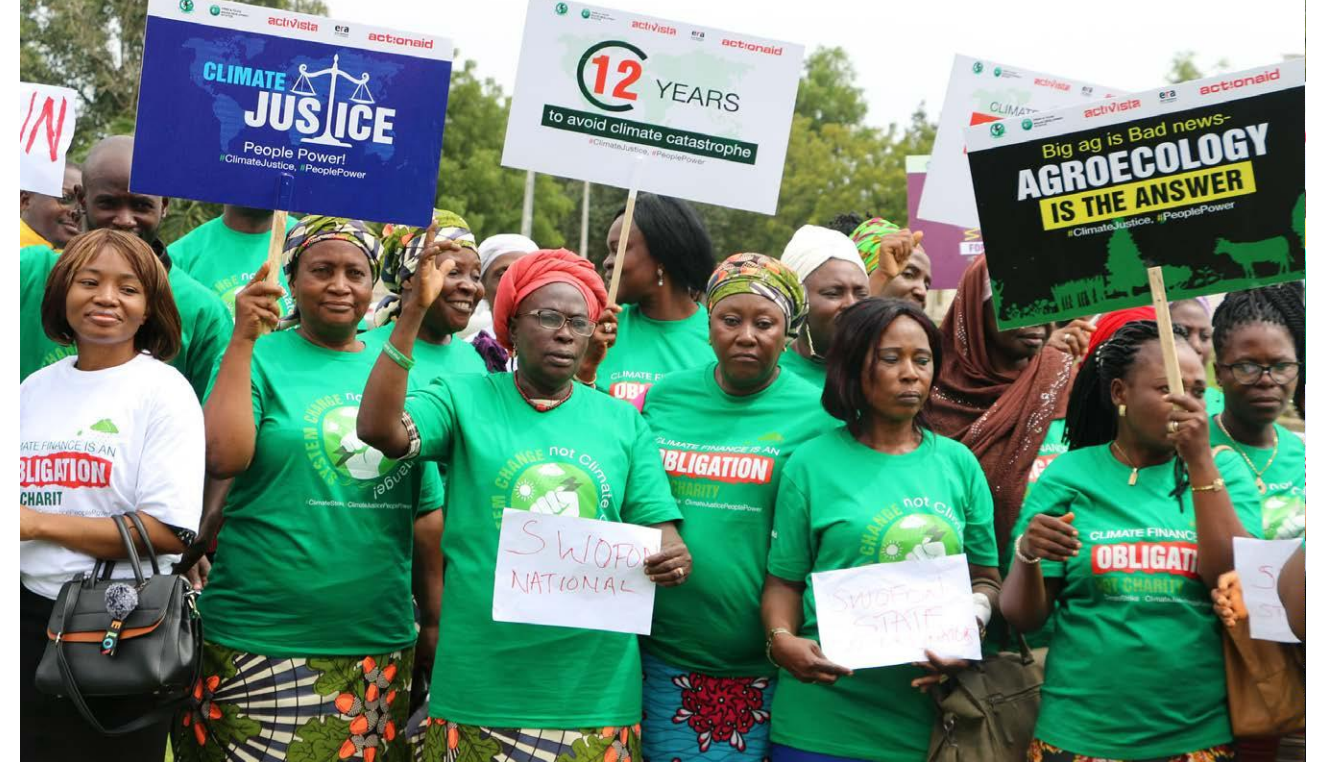
Women farmers march for agroecology and climate justice in Nigeria.