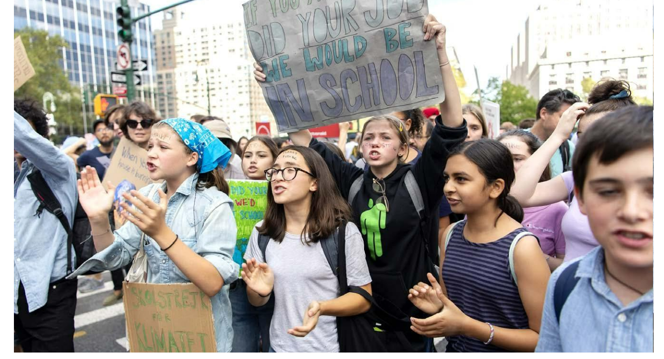
Climate strike in New York: young people and citizens around the world are demanding urgent climate action.