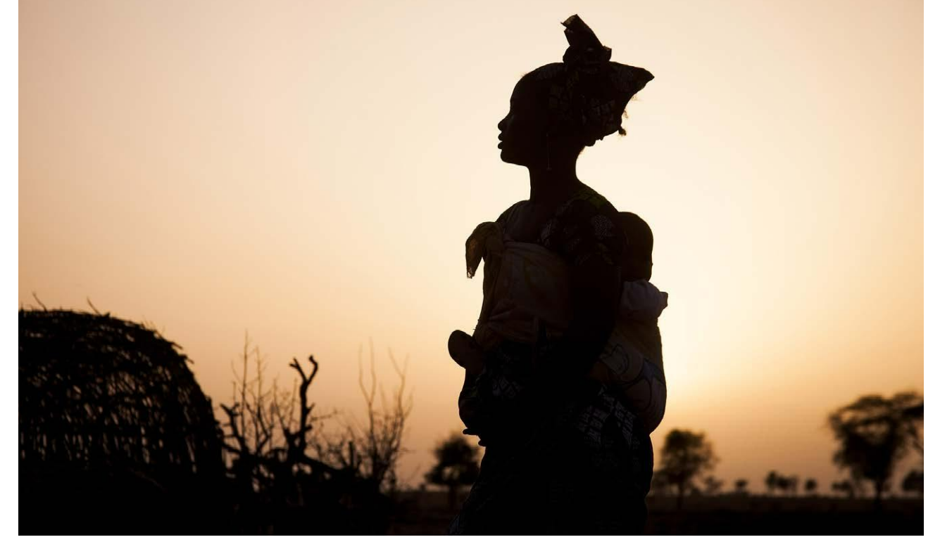
Farmers and inhabitants from 37 villages in Ndiaël, Senegal were at risk of losing their livelihoods when a biofuel company moved into the area with plans to take their lands. Campaigning and advocacy by the community successfully halted the project expansion.