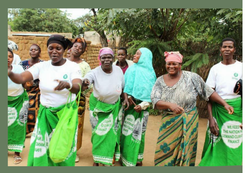
The Coalition of Women Farmers (COWFA) have met with government to advocate on Malawi's National Adaptation Plan (NAP).

This process of empowerment can be extremely effective in giving women confidence. They are then often supported to identify particular gaps and risks, and opportunities for local or national government to provide targeted support. This has often resulted in women farmers' groups effectively lobbying local or national government to allocate budget to services or infrastructure that strengthen the resilience of the community. In Malawi, for example, women farmers have met with the national government to present recommendations for the development of the National Adaptation Plan (NAP).