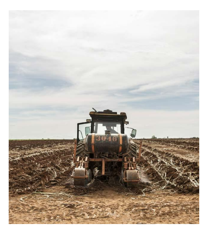
Monocultural industrial farming pushes small farmers off their land and destroys ecosystems.

Conversations with farmers can often begin with the starting point of their livelihoods and visions for rural vitality, instead of a narrative of blame. How are they being affected by dynamics such as corporate control, low wages, health and social cohesion? Are they concerned about the loss of soils on their farms? How is climate change affecting them? What are their visions for the food system? Conversations like these are needed across the supply chain. They can enable communities engaged in the industrial agriculture system to move beyond the fear that the transition to climate-friendly forms of agriculture does not need to be a burden on their already-precarious way of life. Instead, it can be a solution to their problems.