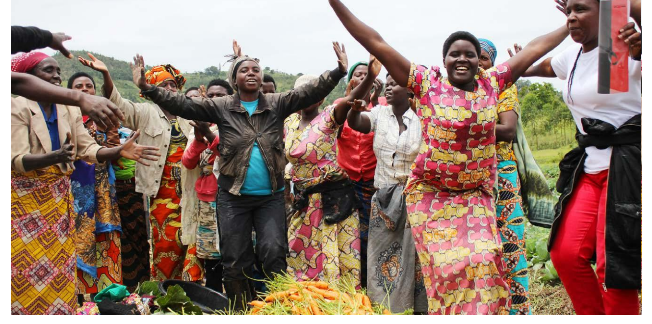
The Aboroshya women's farmers group in Nyanza district, Rwanda met with local authorities to explain their needs. As a result, they were granted access to farmland, on which they are successfully producing carrots and cabbages.