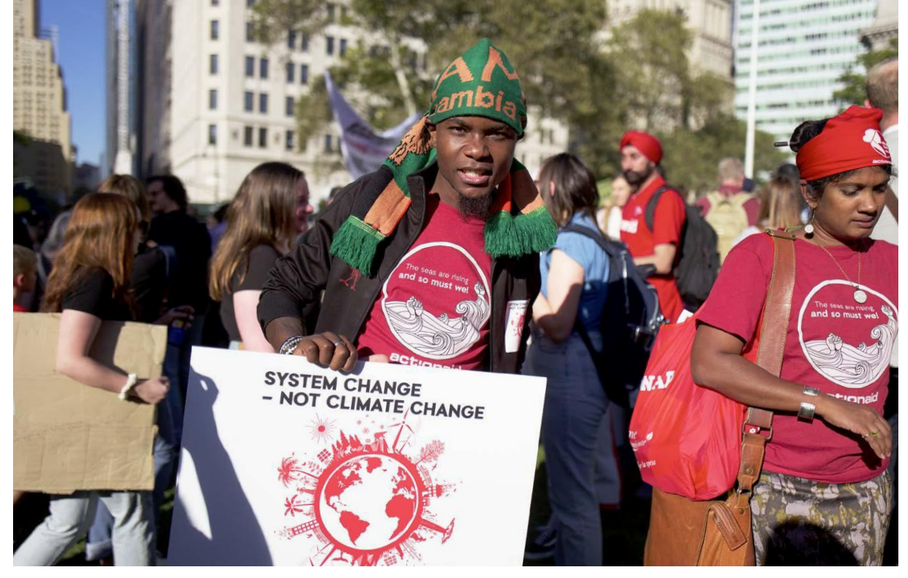
At the climate march in New York in September 2019.