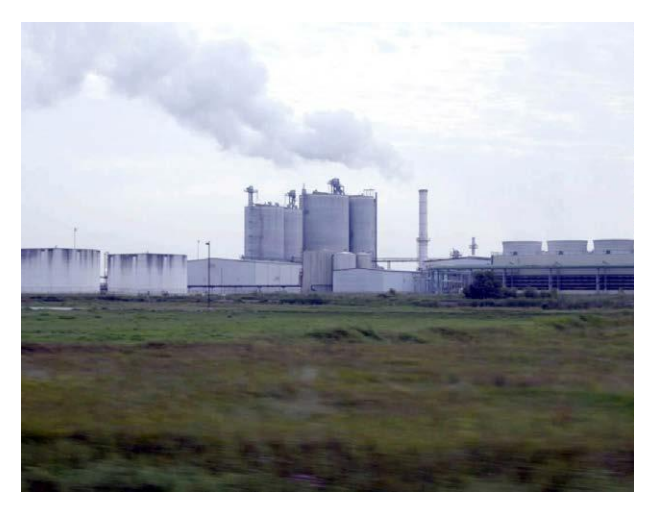
Large scale agribusiness infrastructure in Iowa.