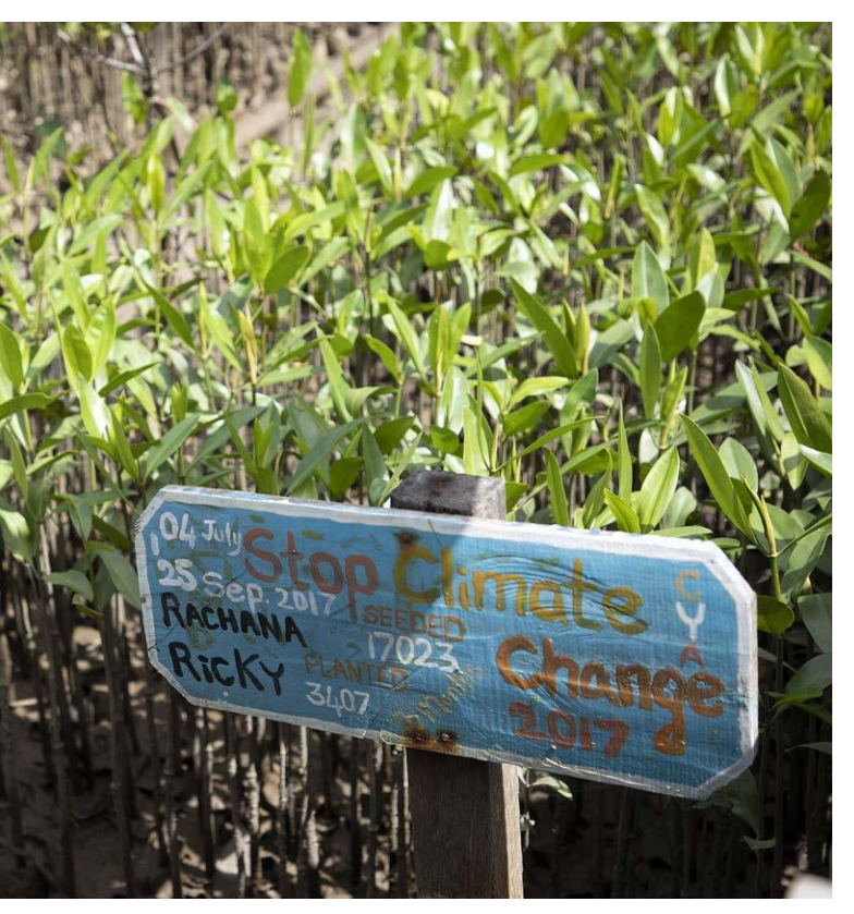
Fishing communities in Cambodia are restoring mangrove ecosystems.

The transition to better meat production and plant-based foods must protect jobs and distribute income fairly. Industrial livestock farming usually requires significant infrastructure and farmers are likely to have made significant investments in that infrastructure, often taking huge loans that they are still paying back. Transitioning from this model of farming risks leaving farmers with stranded assets. Farmers dependent only on one type of farming are likely to find the shift particularly difficult. Industrial livestock farmers therefore need support and incentives to leave this model of farming behind and shift towards alternative approaches.