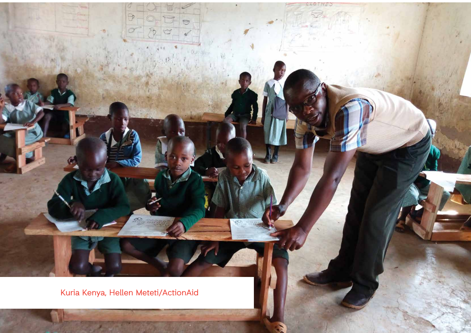
Kuria Kenya, Hellen Meteti/ActionAid

The teaching profession is often highly gendered. The lack of female teachers at different levels can mean girls lack positive role models and patriarchal attitudes are more likely to be perpetuated. The content of teacher training also plays a crucial role; gender-sensitivity in training needs to be much more integrated than it often is. Schools often lack teachers who are trained to support and include children with different abilities and learning needs.