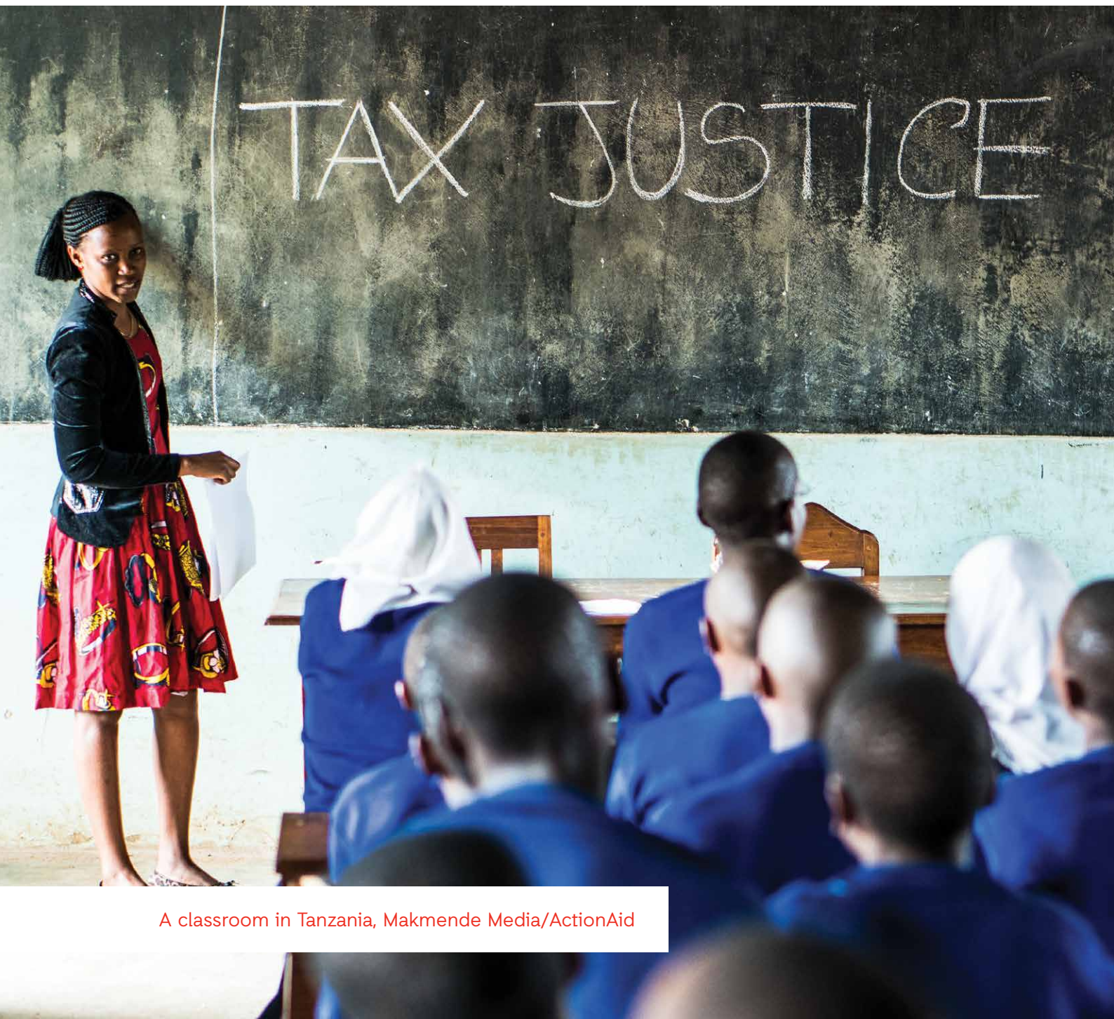
A classroom in Tanzania

For education to be acceptable and adaptable it needs to be relevant . This means that it needs to be taught in the mother tongue and linked to local realities, but this does not mean it needs to employ “localism”. There is universal relevance to ensuring girls and boys are taught about their sexual and reproductive health rights, are supported to make positive choices through life-skills training, and that they are prepared for active citizenship and critical thinking.