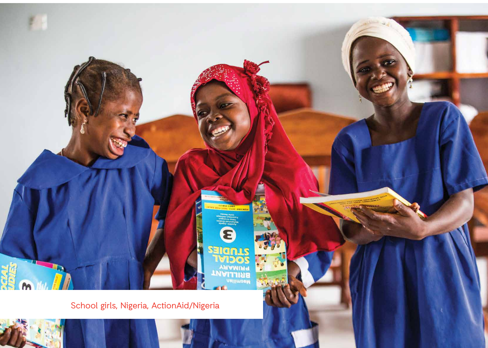
School girls, Nigeria