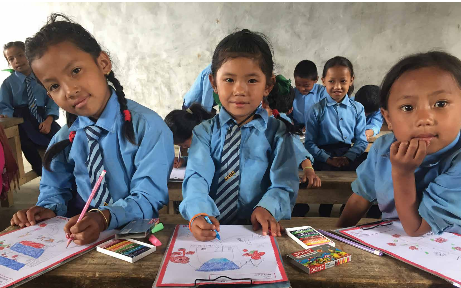
Learners, Nepal, Khagendra Sapkota/ActionAid

Available education does not automatically mean quality education. The skills of the teachers, motivations of the leadership, and space to learn all impact on the quality of the education provided. There should also be no reason for any marked gendered difference in learning outcomes in any subject. The myth that boys are better at science or more suited to maths and science needs to be challenged. The genderisation of subjects can have a lasting impact, disadvantaging girls at higher levels of education and affecting career opportunities. It is important to collect credible disaggregated data on both the breadth of learning (ensuring all children learn across a broad curriculum) and the depth of learning (ensuring girls and boys are learning enough and can use what they learn in practice) and ensuring children with different learning needs and abilities are supported and included in mainstream education.