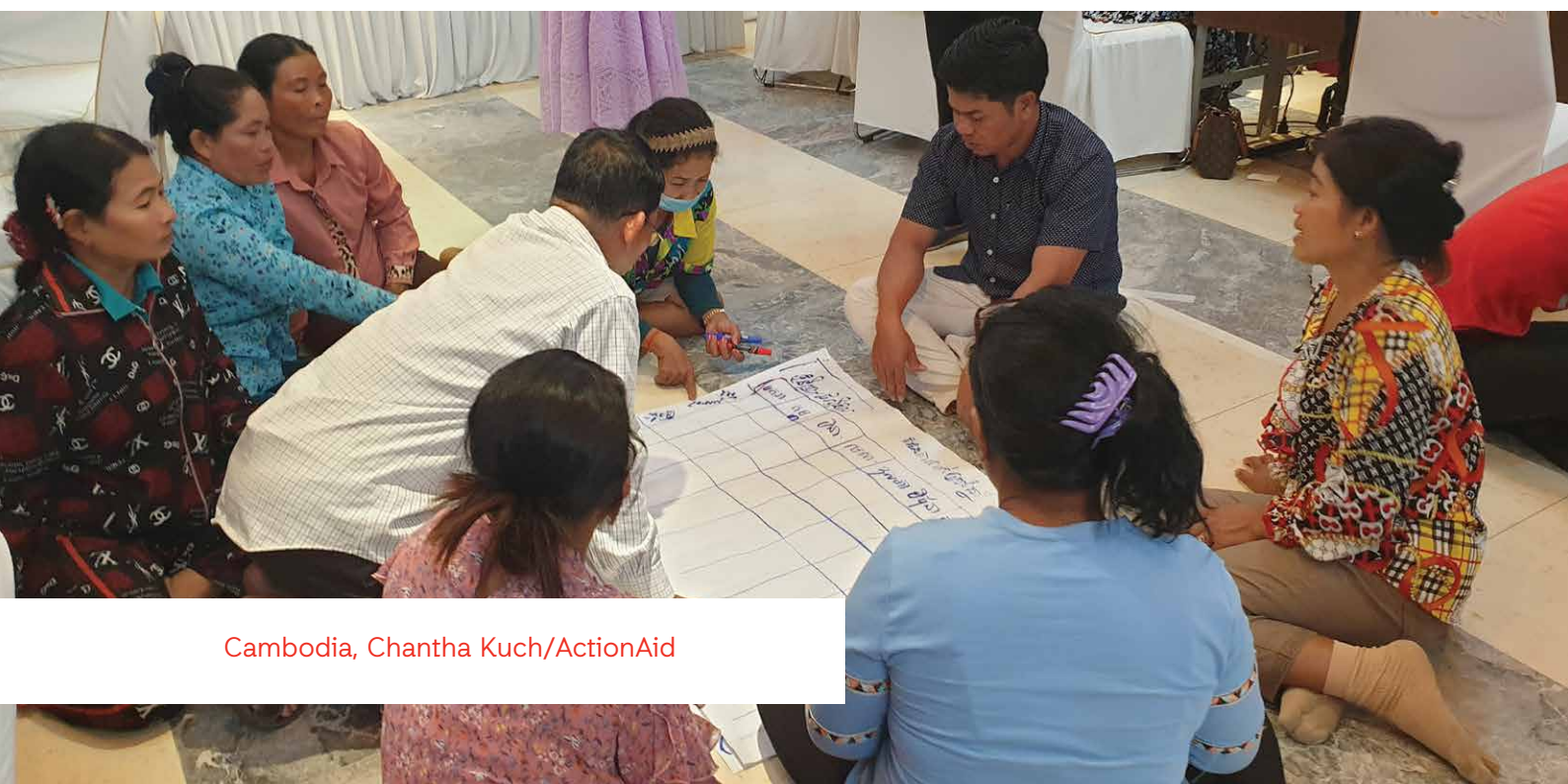
Cambodia, Chantha Kuch/ActionAid

In our experience, a good School Improvement Plan (SIP) is an essential tool to address and change any bad practices found, or gaps highlighted. It is very important that any proposed changes or suggestions within the school improvement plan are gender and