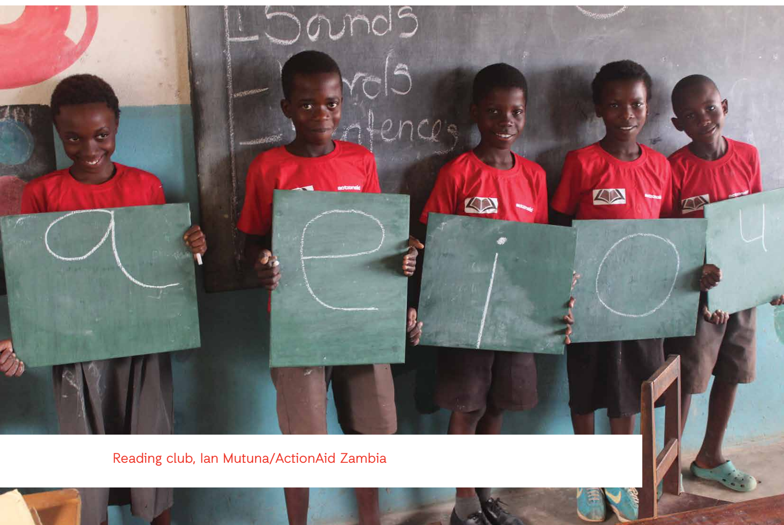
Reading club

Girls and boys have an equal right to participate meaningfully in decision-making in schools. Tracking who speaks in key forums and whose voice is given weight can help to ensure that biases are diminished. The participation of children, especially girls or children from marginalised groups, in a democratic space in their schools can be a foundation for meaningful participation and leadership in wider society.