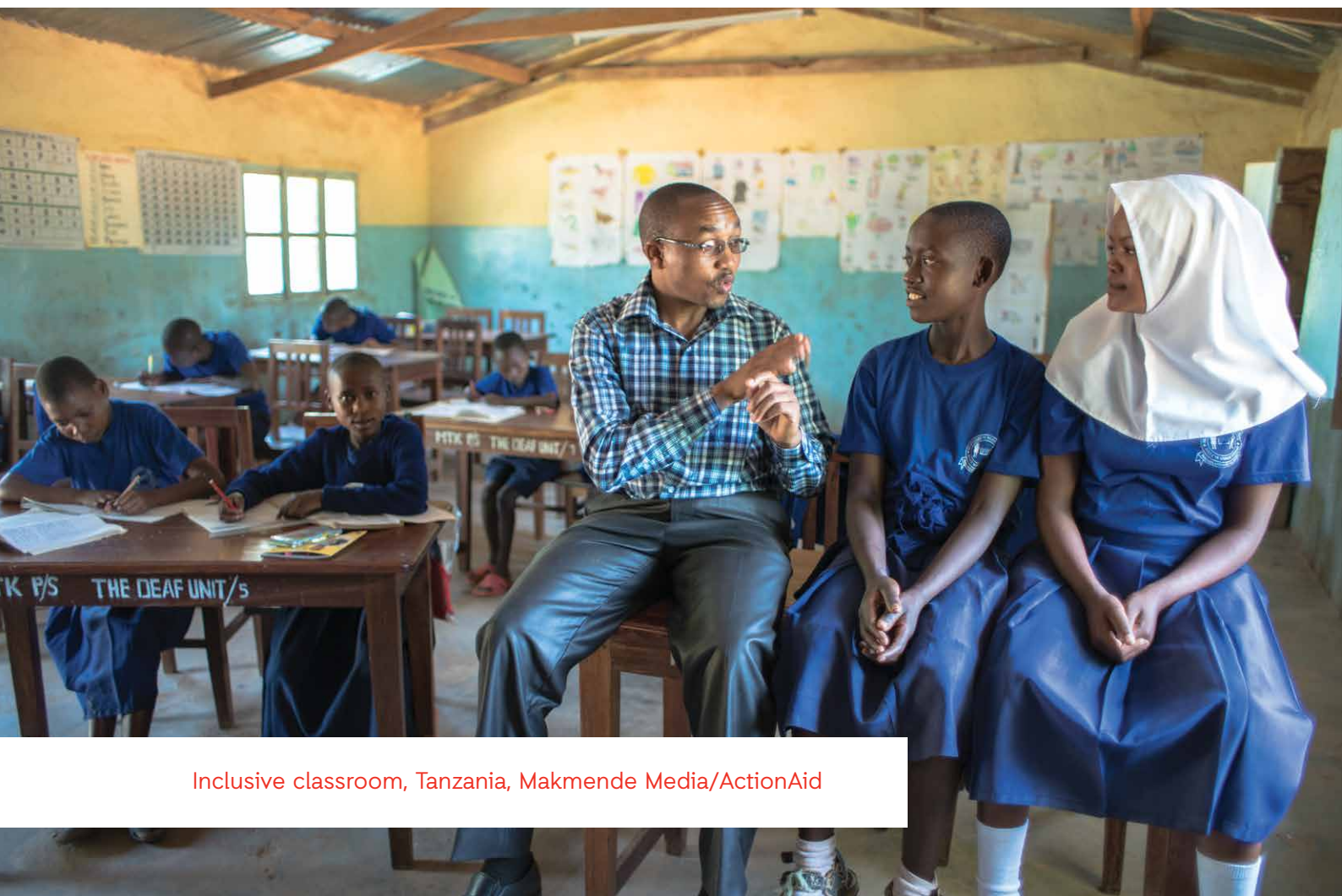
Inclusive classroom, Tanzania

When school infrastructure is inadequate, girls are often the first to suffer. For example, in the case of sanitation facilities, unless there are safe, decent and separate facilities for girls and boys, the impact can be to push girls out of school either permanently or on a temporary basis (for example, during menstruation). Where national minimum standards for the provision of sanitation exist, these should be applied. All sanitation facilities, should at least reach the globally-established minimum standards for school sanitation and WASH , e.g. SPHERE minimum standards (see Annexe 6).