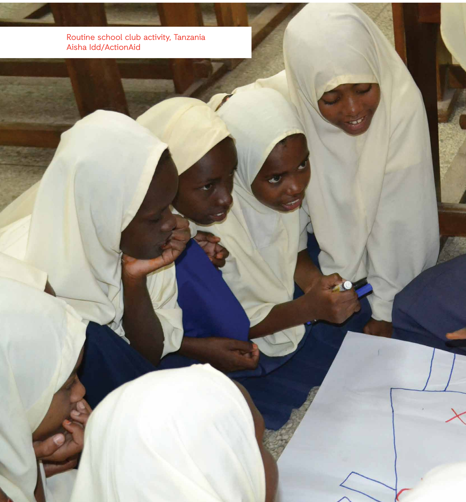
Routine school club activity, Tanzania

With this information, it is possible to raise community awareness of the ten rights and to encourage stakeholder engagement. This could mean, for example, working with local stakeholders, developing relevant posters, leaflets or other awareness-raising messages, including technological and social media where relevant or practical. It is important to think about what type or style of messages will best encourage engagement from traditional authorities and governing institutions.