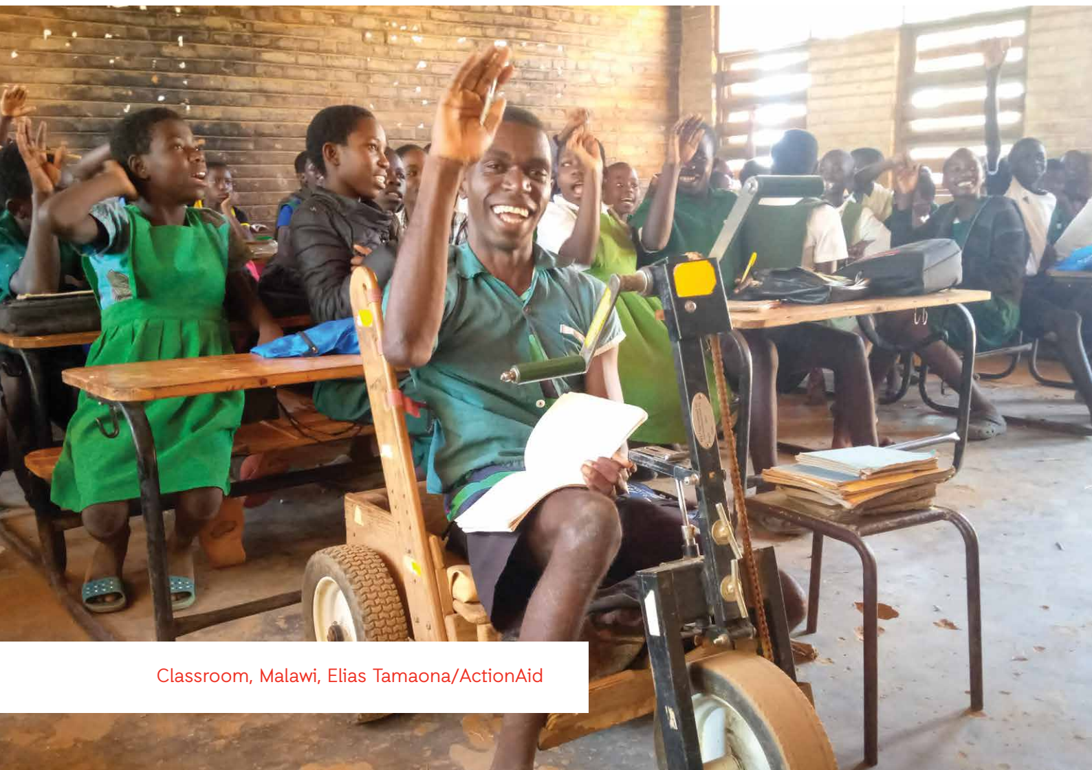
Classroom, Malawi

They should also help to determine whether parents of children who suffer discrimination are adequately supported.