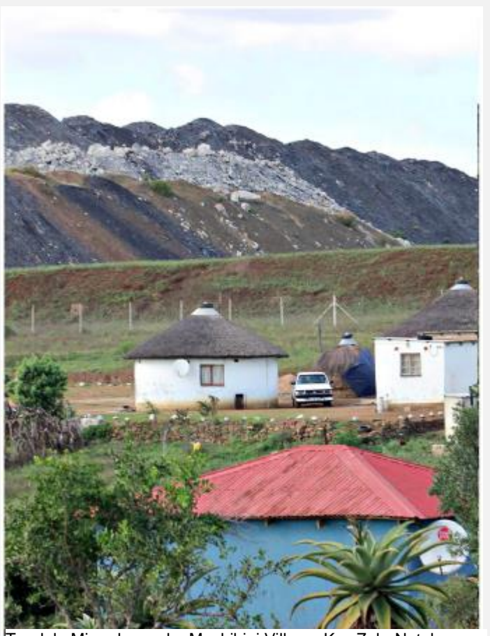
Tendele Mine dumps by Machibini Village, KwaZulu-Natal.

ActionAid South Africa has used the methodology of Social Audits to compare what mining corporations have committed to on paper in the SLPs, with what is happening on the ground.ii In many areas of South African life, this approach has become popular as a way to raise issues of power, gender, and class. In 1994, South Africans put their trust in the first democratically elected government and communities that had been organised in resistance to apartheid demobilised. The Social Audit has become a vehicle for remobilising twenty years later.