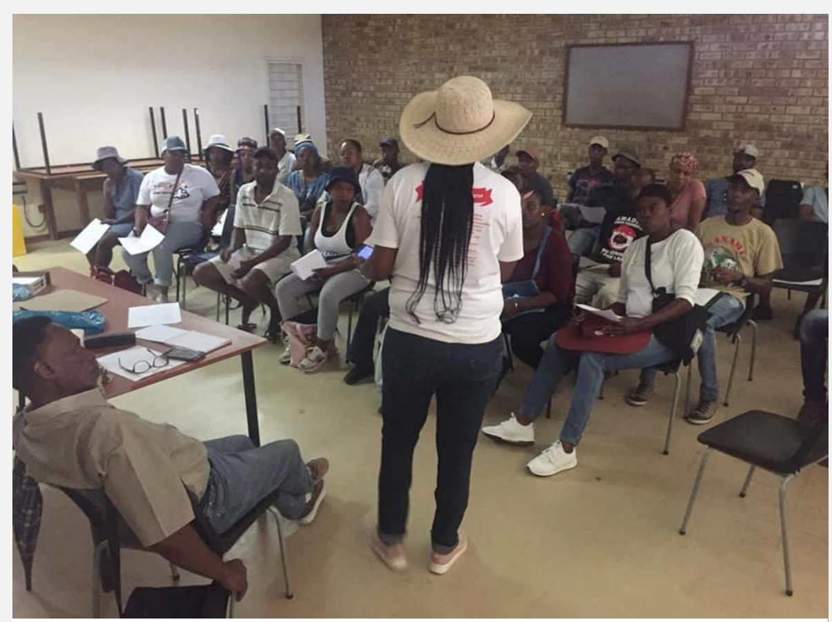
ActionAid South Africa Natural Resource team with Mining Affected Communities United in Action- Macua. and WAMUA

"A social audit provides a way to build effective and meaningful public participation in poor and workingclass communities, ... a means for the community to engage with the governance processes that affect their lives." Social Audit Network