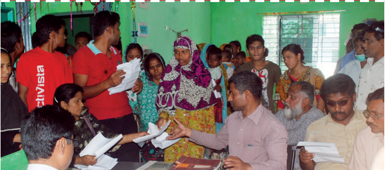
YOUTH IN BANGLADESH SUPPORT COMMUNITY MEMBERS TO CHALLENGE A FRAUDULENT LOAN SCHEME

In Chilahati Upazila, Bangladesh, a female local community group member raised concerns about a fraudulent loan scheme that was intended to support acutely poor households, but was being targeted at households that had not applied to the scheme. Those exploiting the system were receiving the bulk of the loan, meaning that poor households were only receiving 3% of the full loan amount, yet were saddled with 100% loan repayments. When local youth group members heard about this, they mobilised to seek additional information.