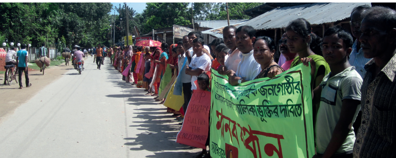
YOUTH IN JOYPURHAT, BANGLADESH, CAMPAIGNING FOR INDIGENOUS PEOPLE'S RIGHT TO LAND