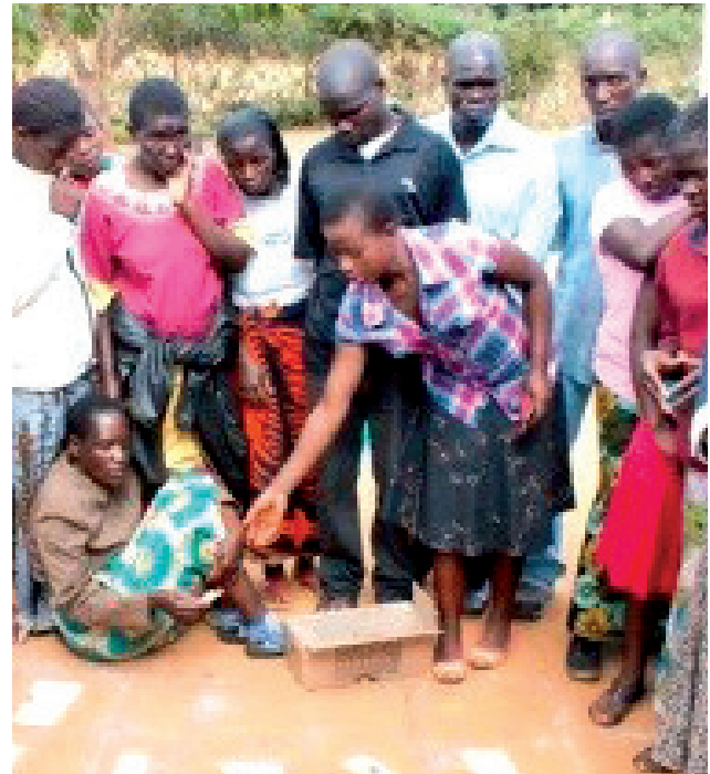
YOUNG MALAWIANS LEAD REFLECTION-ACTION GROUPS IN NTCHISI LOCAL RIGHTS PROGRAMME

Many ActionAid countries have taken steps to include young people in their programme management structures in local rights programmes. For example, ActionAid Zambia ensure that young representatives are involved in all programme planning on LRP Management Committees. This has strengthened accountability, as young people have access to the types of information needed to question the allocation of project budget lines, and demand that targets are set and monitored for the numbers of young people who will take part in key activities. Institutional engagement between ActionAid and youth groups at local levels provides a systematic mechanism for regular follow-up to ensure youth concerns are being integrated into all areas of work. Meanwhile, ActionAid Liberia reports that working in partnership with young men and women to conduct annual programme evaluations has been essential for encouraging diverse youth to demand accountability from ActionAid.