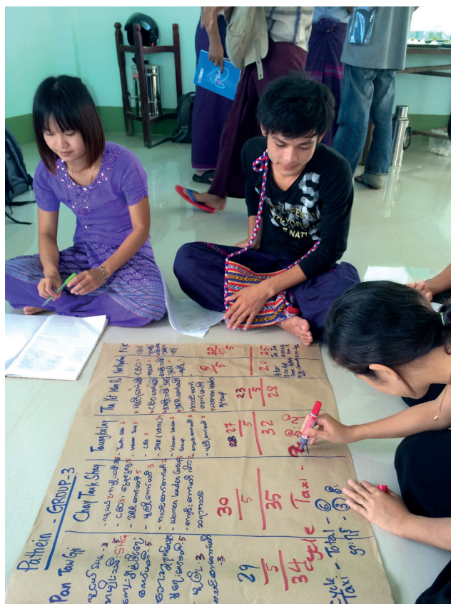
YOUNG PEOPLE IN MYANMAR HAVE BEEN TRAINED TO LEAD PARTICIPATORY REVIEW AND REFLECTION PROCESSES