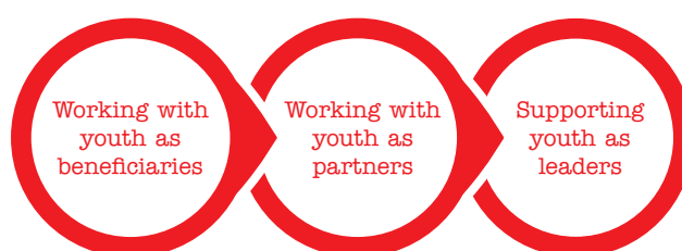
DIAGRAM 2: ADAPTED FROM: HUXLEY, S IN THE DFID-CSO (2010) YOUTH PARTICIPATION IN DEVELOPMENT GUIDE