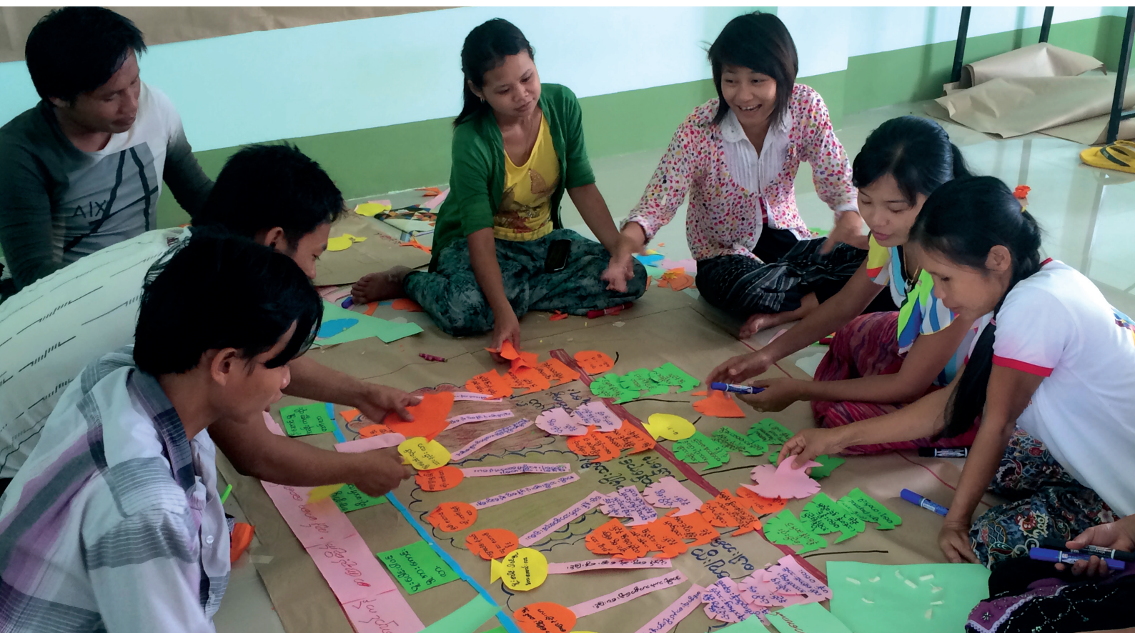
MYANMAR YOUTH PREPARE TO CONDUCT A SITUATION ASSESSMENT FOR A NEW LOCAL RIGHTS PROGRAMME

The experience of ActionAid Myanmar, which has been promoting youth participation and leadership across every stage of the programme cycle since 2006 and the establishment of its youth-centred Fellows programme, strongly highlights that the promotion of youth leadership can help to cultivate a stronger, more diverse civil society. For example, in 2014, 8 new community based organisations (CBOs) have been set up across Myanmar by young people who have been through ActionAid's