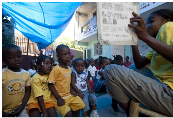
Children attend lessons in a makeshift classroom at a school in Philippeau.