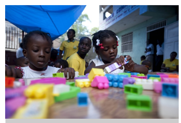
Children at the Ecole Communautaire De Philippeau, a school supported by ActionAid partner COZPAM, play with toys as part of a psychosocial programme.