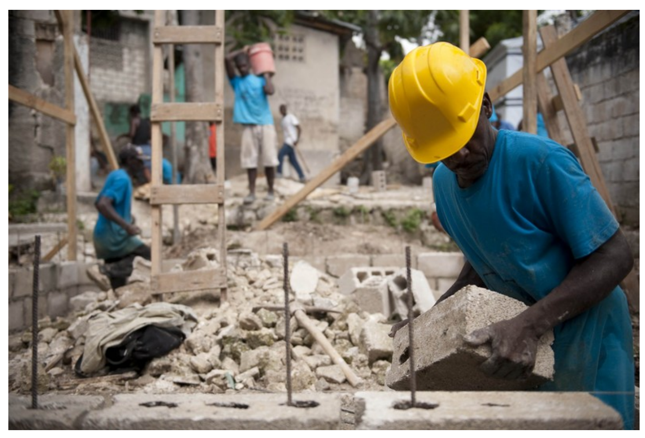
Haitians rebuilding Haiti: progress six months after the earthquake