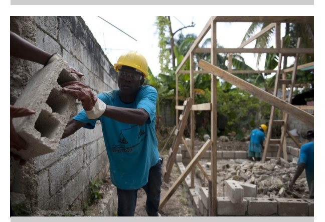
Community members assist with the construction of a transitional shelter in the Bon Berger camp, Mariani.