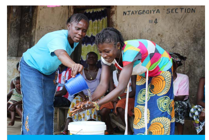
Handwashing point in Sierra Leone during the Ebola crisis

Women community mobilisers went from door-to-door raising awareness, encouraging people to listen to the radio to keep up-to-date on the spread of the disease and the advice being given. Dramas were performed and special Ebola songs played on radio and TV. The women also set up public handwashing points and kept them topped up with chlorinated water.