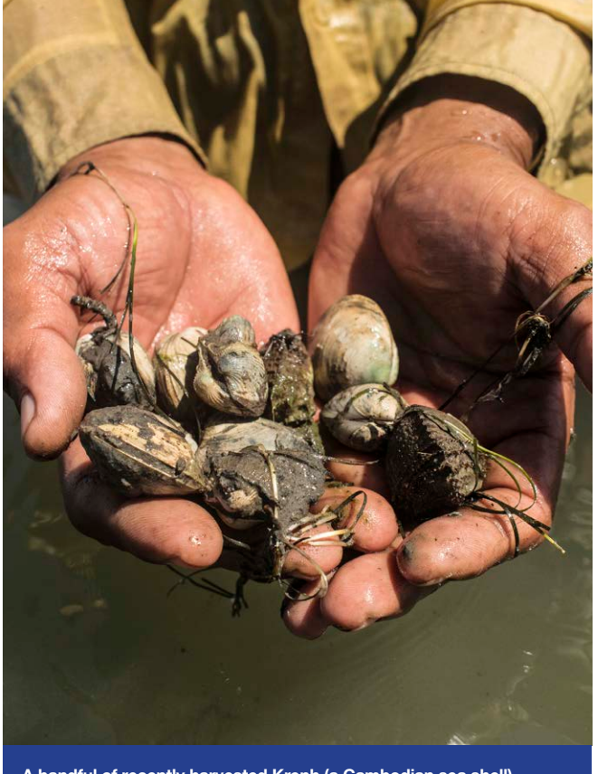
A handful of recently harvested Krenh (a Cambodian sea shell).

There were many critical factors that contributed to the successful claiming back of community fishing areas in Chroy Svay commune. Women in the two villages stepped up and organised themselves and the rest of the community, and sought support from local organisations to plan for a non-violent campaign to claim back their communities' fishing rights. Solidarity and