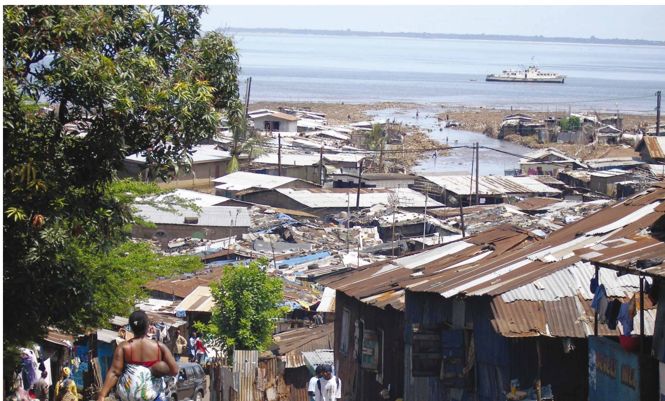
Freetown, Sierra Leone