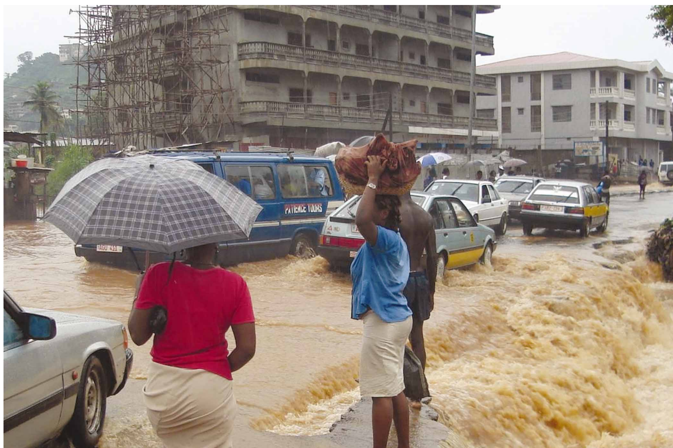
Freetown, Sierra Leone