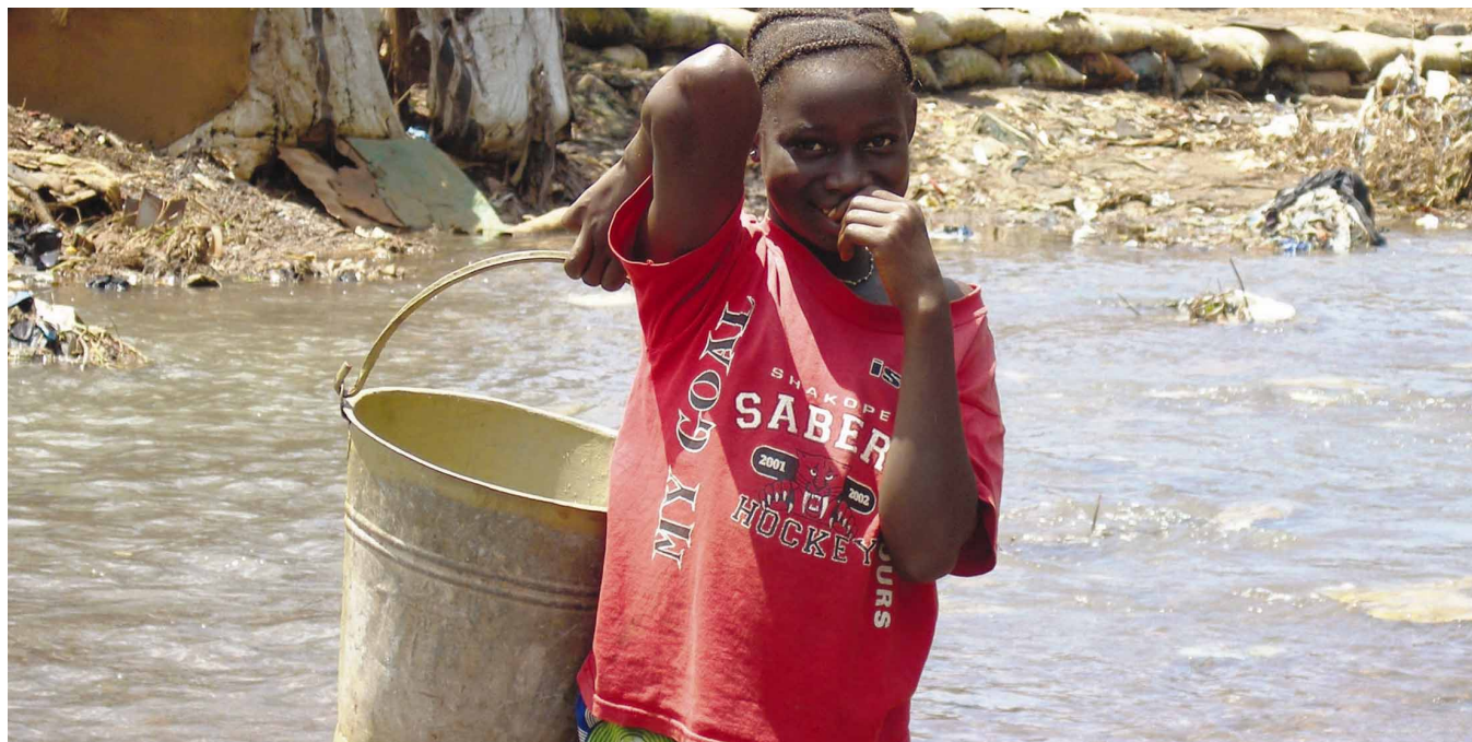
Freetown, Sierra Leone