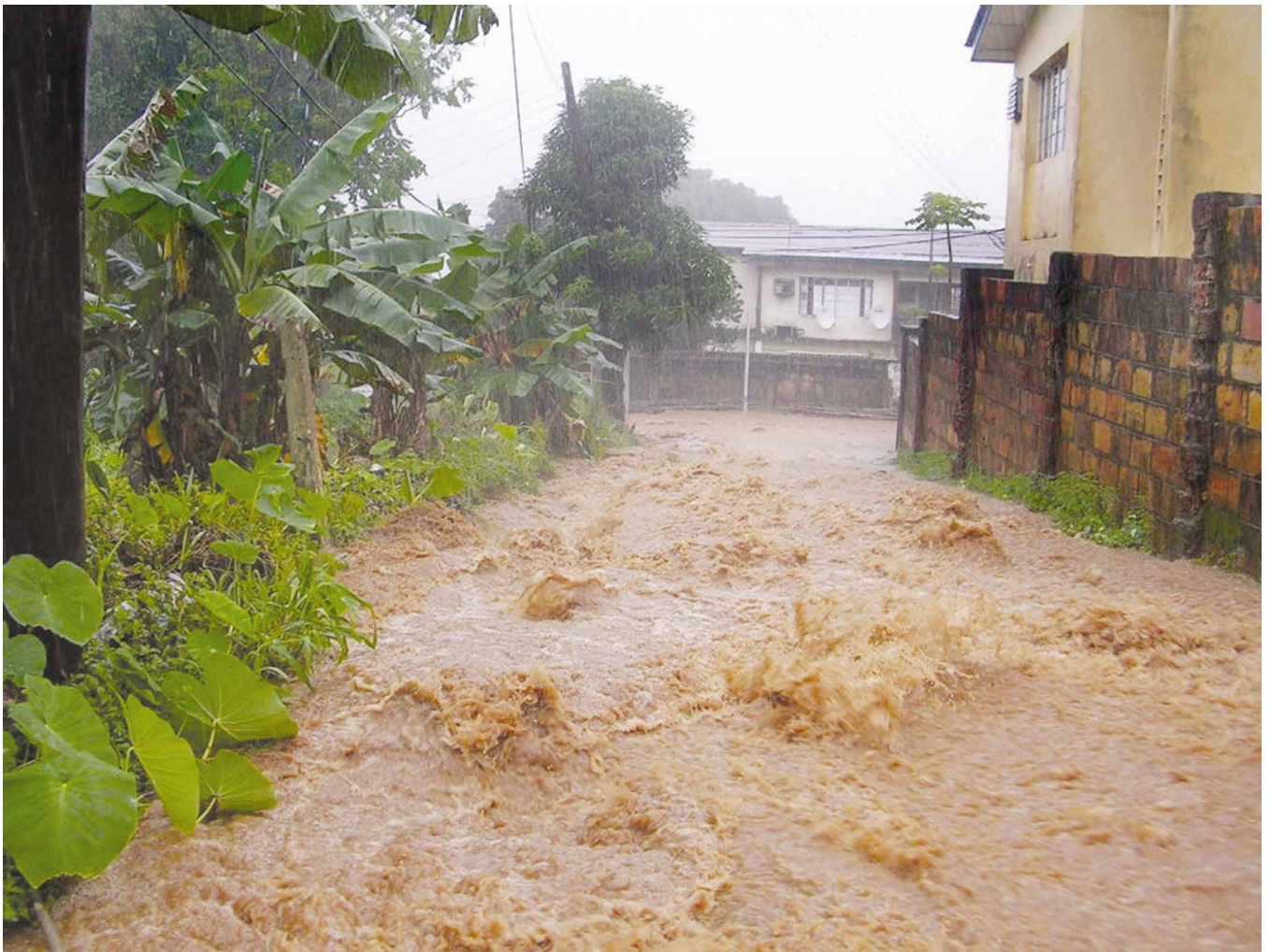
Freetown, Sierra Leone