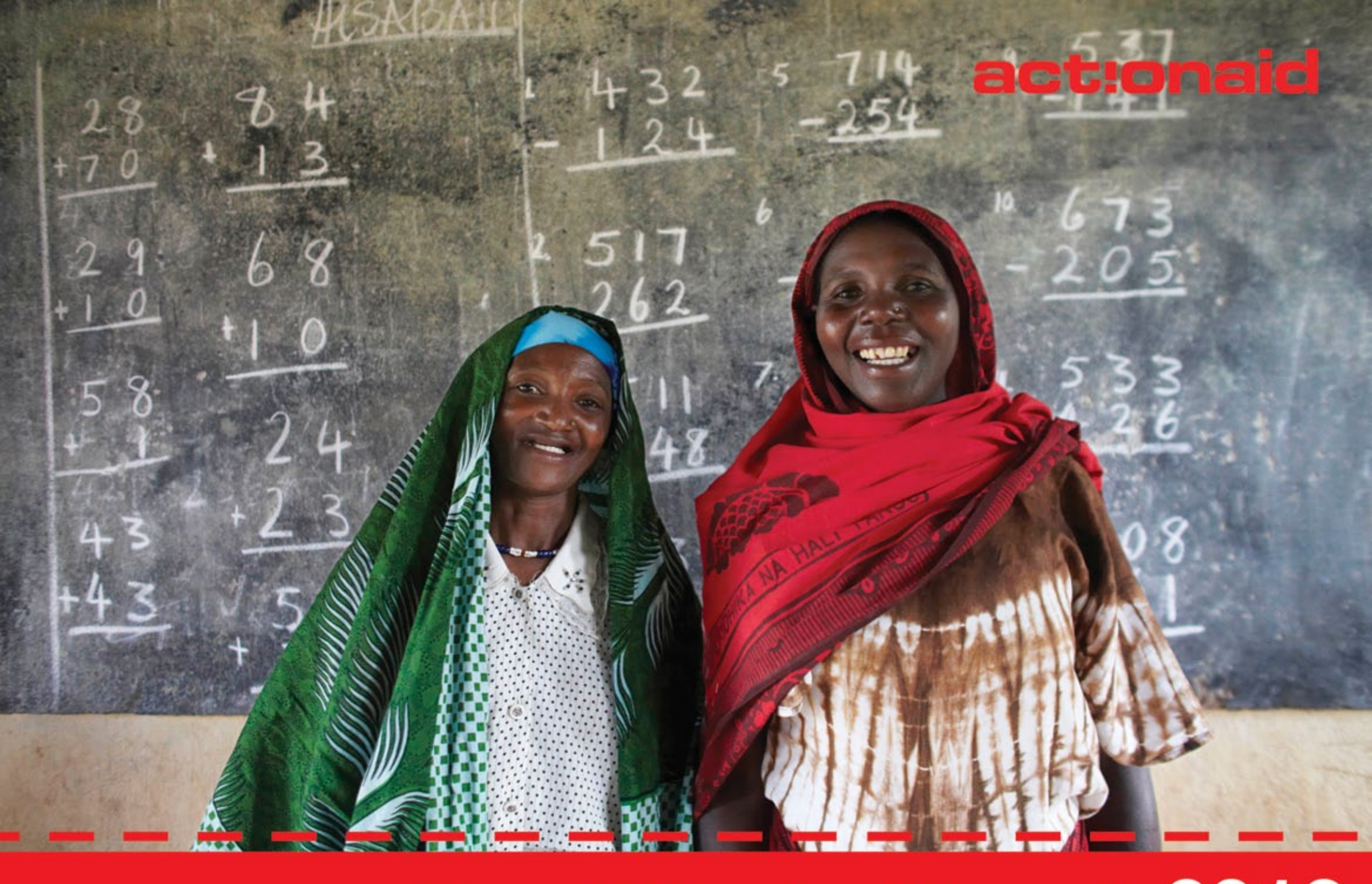
Financial Report and Accounts 2012